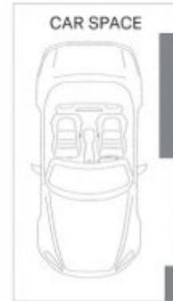
LEVEL SIX (BASEMENT)