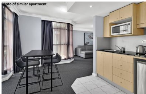
Photo of similar apartment