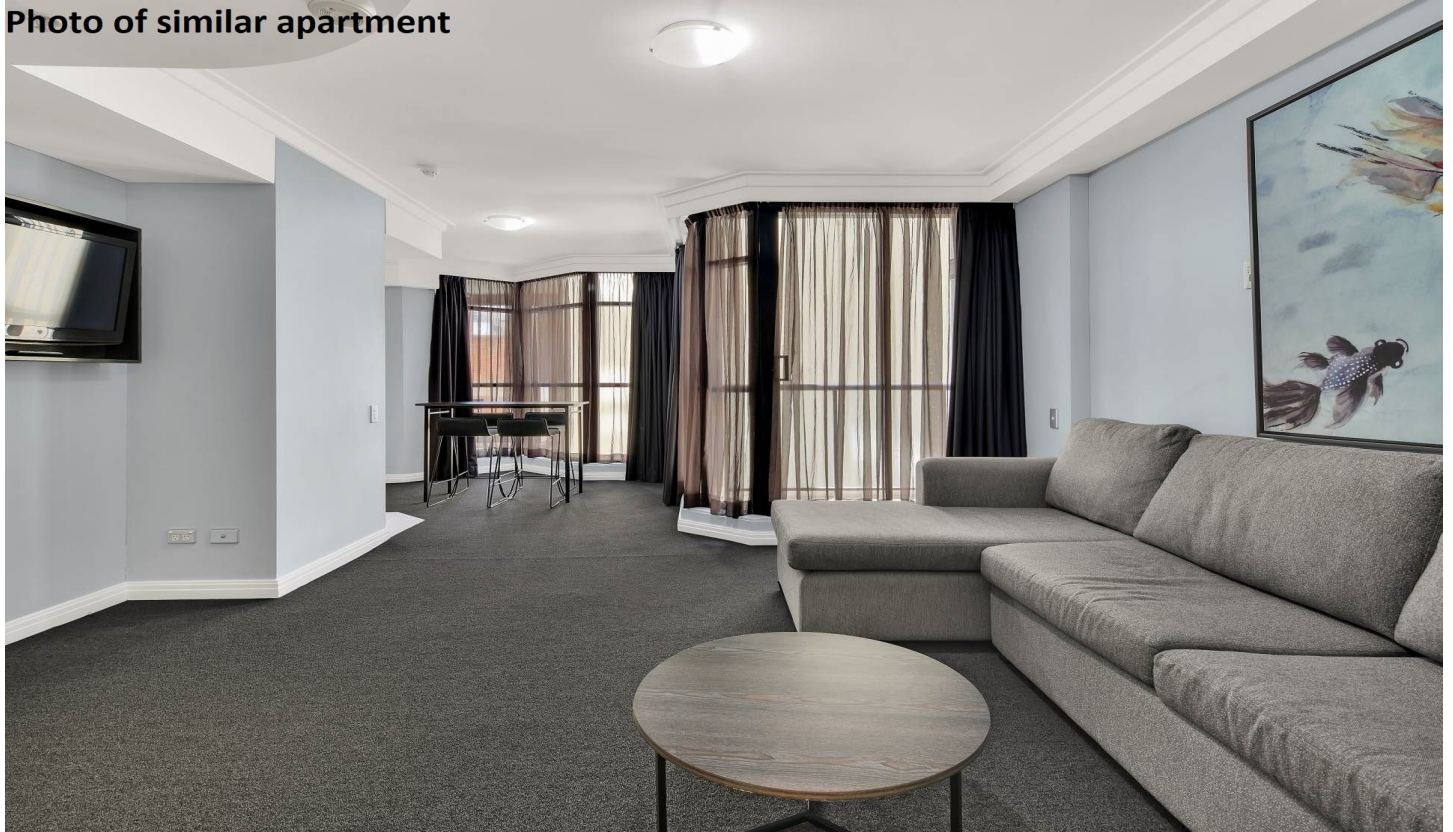
Photo of similar apartment