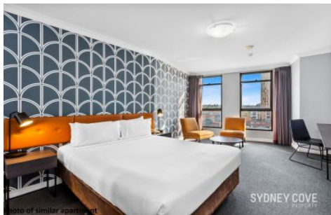
Photo of similar apartment