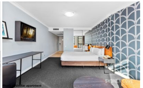
Photo of similar apartment