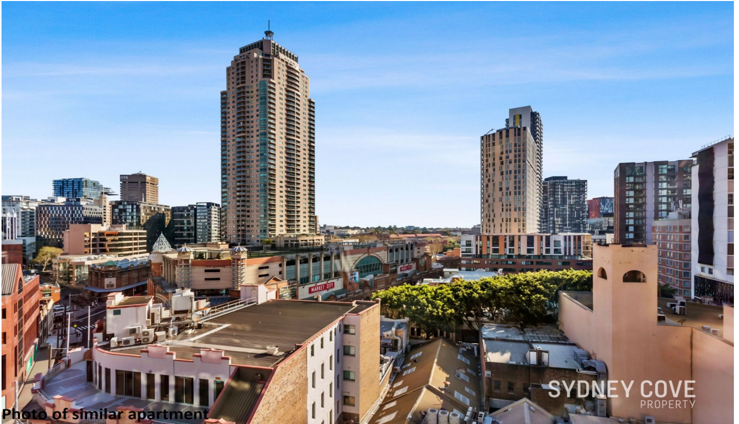
Photo of similar apartment