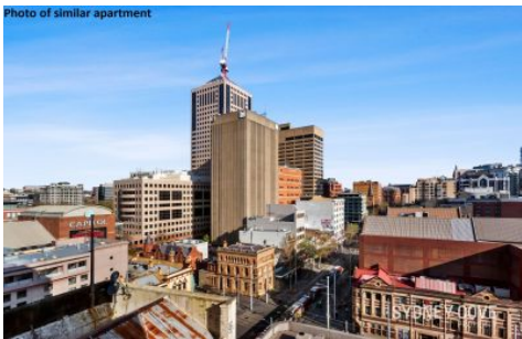
Photo of similar apartment