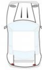
SINGLE CAR SPACE (CAR STACKER)