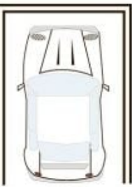
SINGL SECURE CAR SPACE