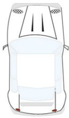
SINGLE SECURE CAR SPACE