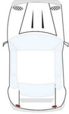
SINGLE SECURE CAR SPACE