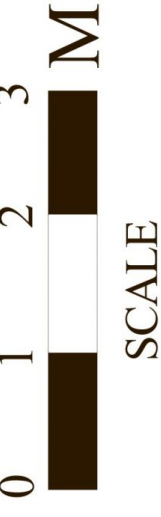
127 Kent St Sydney All measurements are approximate only. Plan is provided as an indication of layout