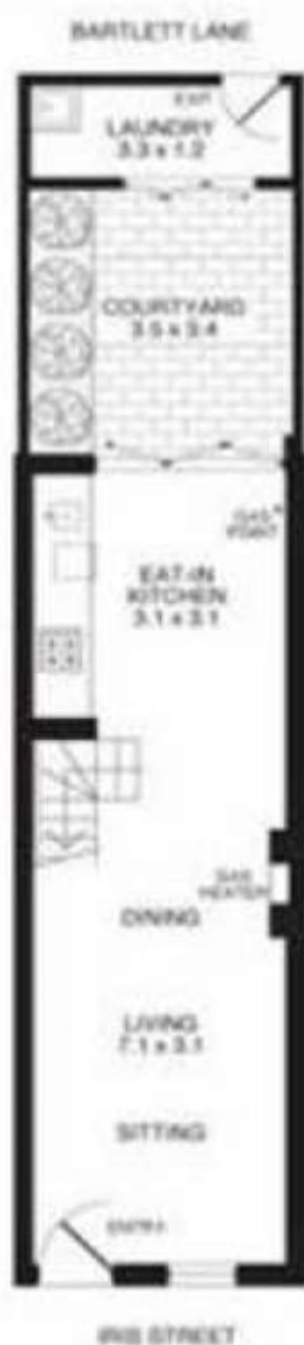
GROUND FLOOR Scale 1:200 = 1m (approx)