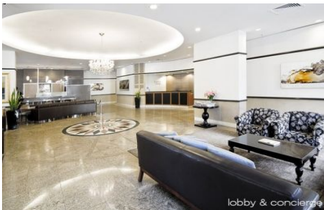
lobby & concourse