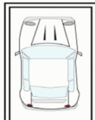
SINGLE SECURE CAR SPACE